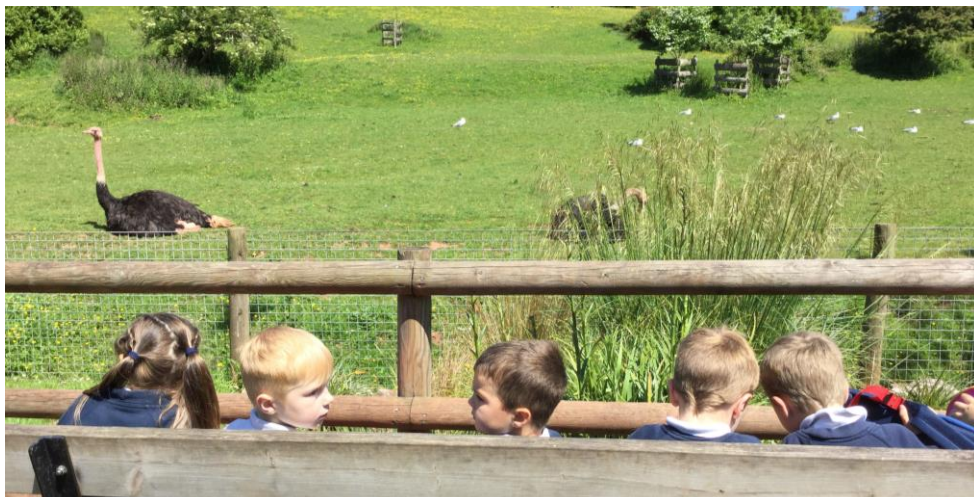
Reception had a great time at Paignton Zoo!