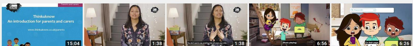
Thinkuknow. An Introduction to Parents and Carers 2.9K views • 4 months ago Thinkuknow Jessie & Friends: film for parents an... 2K views • 1 year ago Thinkuknow Jessie & Friends: film for parents an... 1.2K views • 1 year ago Play Like Share: Episode 1 Subtitled 5.7K views • 2 years ago Play Like Share: Episode 2 Subtitled 4.5K views • 2 years ago

The YouTube channel includes lots of information and advice to help you keep your child safe and access support. The 30- to 60-second videos set out simple things that Parents/Carers can do to keep their child safe while they're engaging in different online activities such as live streaming and gaming. Above shows just some of the videos that are available!