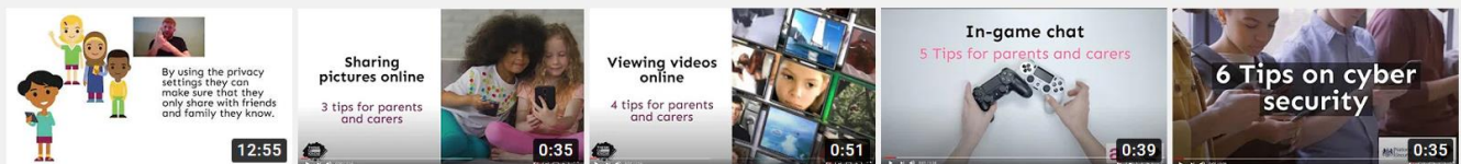
BSL language version - Parent and Carers sharing ... 52 views • 3 weeks ago Tips for parent and carers - sharing images 186 views • 1 month ago Tips for parents and carers - viewing online videos 122 views • 1 month ago Tips for parents and carers - in game chat 196 views • 1 month ago Tips for parents and carers - cyber security 84 views • 1 month ago

Thinkuknow is an online safety education programme from the National Crime Agency's CEOP command. Thinkuknow aims to empower children and young people aged 4-18 to identify the risks they may face online and know where they can go for support. They also have some fantastic video guides for Parents/Carers, which can be accessed through their YouTube channel and website .