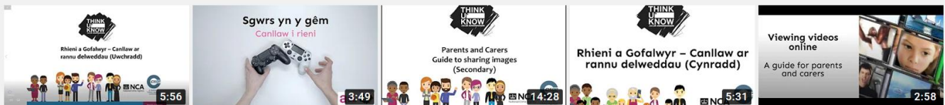
Rhieni a Gofalwyr - Canllaw ar rannu delweddau ... 27 views • 1 month ago Sgwrn yn y gêm. Canllaw i rieni 24 views • 1 month ago BSL language version - Parent and Carers sharing ... 44 views • 1 month ago Rhieni a Gofalwyr - Canllaw ar rannu delweddau ... 9 views • 1 month ago Guide to watching online videos 901 views • 2 months ago