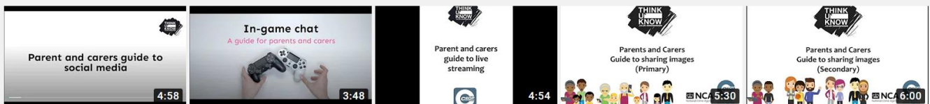
Guide to social media 873 views • 2 months ago In - game chat: A guide for parents and carers 1.7K views • 3 months ago Parent and carers guide to live streaming 2.1K views • 3 months ago Thinkuknow. Parent and carers guide to sharing ... 2.5K views • 3 months ago Thinkuknow. Parent and carers guide to sharing ... 1.1K views • 3 months ago