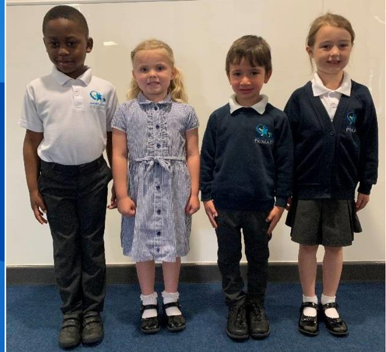
As we move into the warmer months, please remember that gingham summer dressers are to be those described as navy (not blue), examples of which can be found here and here. Dark grey tailored shorts, the same colour as the school trousers, are also ok to be worn. Sandals are not appropriate for school and children are to continue to wear their school shoes with white, grey or black socks.

Children in Years 1, 3 and 4 took part in a Clubbercise taster to promote a new club we will be adding next year to provide links with our local community. The children (and staff!) had a fantastic time dancing and exercising all the while having fun! The glow sticks and disco lights were definitely the highlight!